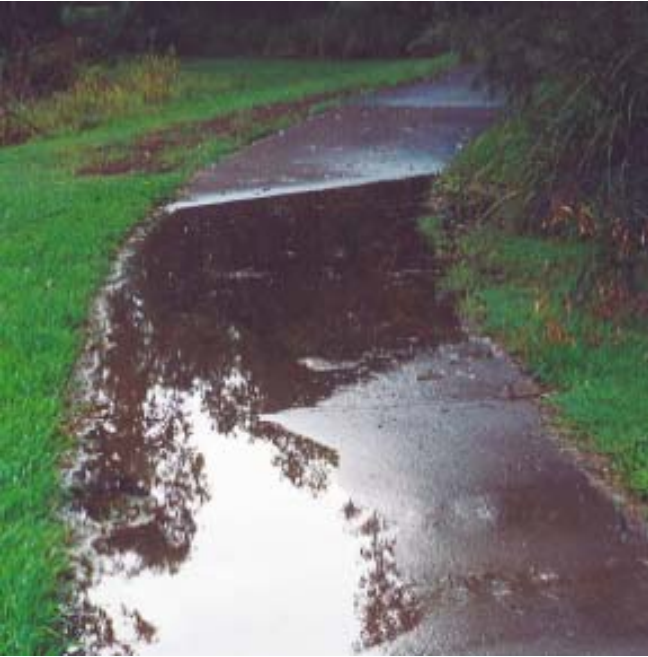
Poor drainage design and/or maintenance, resulting in standing water, can adversely impact the continuity and safety of cycling and walking routes.