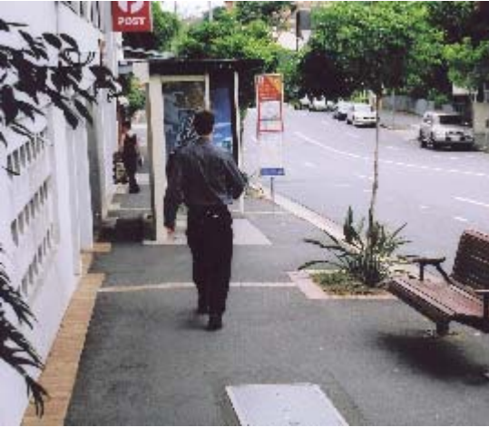
Pedestrian-unfriendly street furniture layout (Queensland Transport 2005)

The issues of sight lines at driveways should also be considered, including the ability of both driveway and path users to anticipate potential conflict.