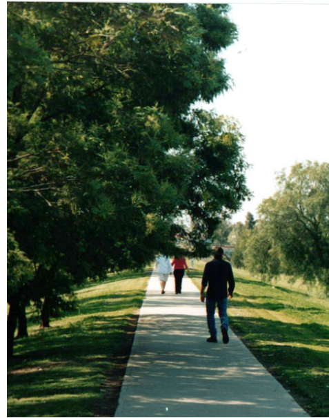
Overhanging vegetation can substantially reduce the effective width of a path and should be trimmed back regularly.

Well-maintained vegetation/landscaping is important, but design and management of reticulation should avoid path overspray in order to prevent users from slipping and to increase comfort. Mowing path surrounds can throw burrs and grass clippings onto paths, which should be swept after vegetation maintenance such as mowing or pruning.