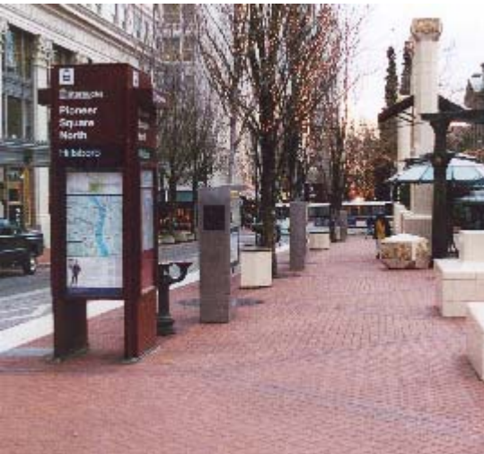
Pedestrian-friendly street furniture layout (Queensland Transport 2005)