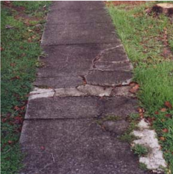
Councils need to assess the level of risk posed by conditions such as this cracked pavement, and determine the appropriate maintenance level